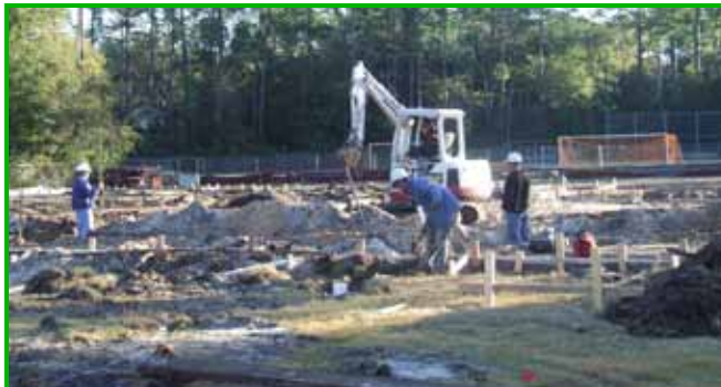
Building Progress on the New School

While we will continue to monitor closely the construction progress on the school's addition, we are also focusing attention on the required