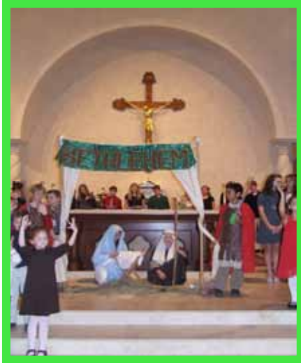
Jesus is the Reason for the Season SJDR Christmas Program