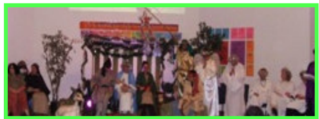
Living Nativity sponsored by L'Arche Harbor House