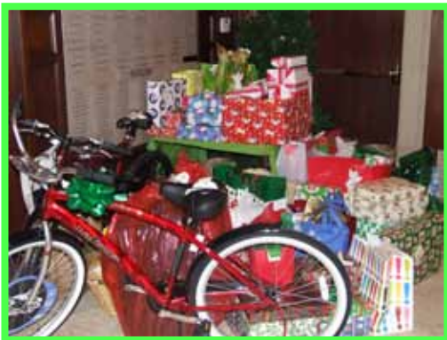
Gifts for the "angel tree" from generous SJDR parishioners