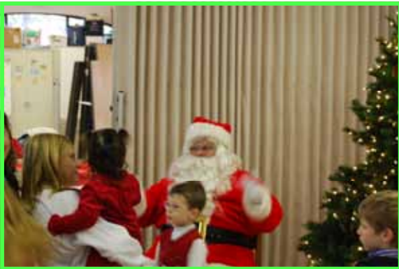
Annual K of C Breakfast with Santa